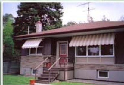
Drop Arm Awnings