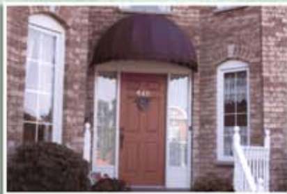
Quarter Ball Awnings

Inquire about these and many other great products by ROLLTEC®