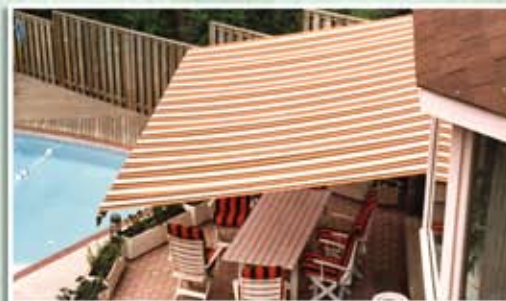
Physique XL™: designed for a 13' projection