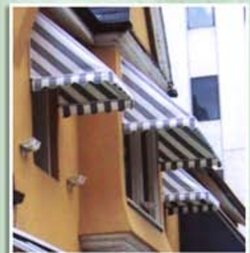
Two Rib Basket Awnings