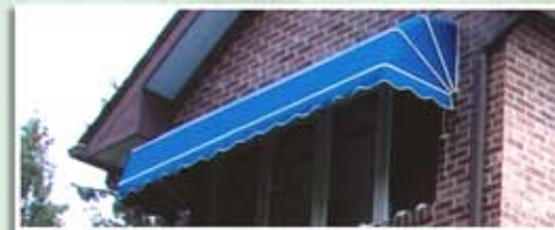
Four Rib Basket Awnings