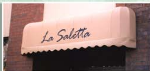
Stretched Quarter Ball Awnings