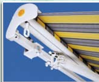
Bravo™: Semi cassette retractable awning